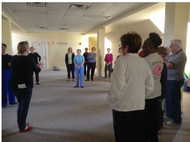
Members prepare for a session of Tai Chi at the Yoga room in the Mathews Athletic Center